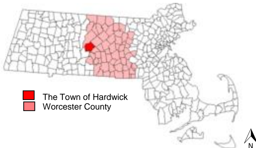
Figure 2: The Town of Hardwick and Worcester County in Massachusetts

Hardwick is a rural New England town in Worcester County (see Figure 2) with a rich heritage and outstanding natural resources, including brooks, open fields, agricultural homesteads, and vast tracks of forests. It is located 30 miles to the west of the city of Worcester