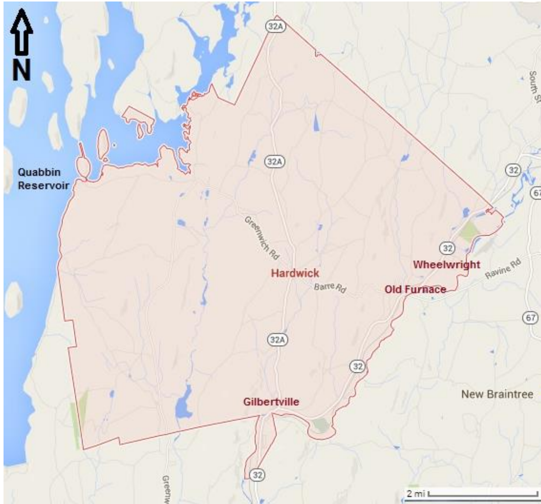
Figure 3: The town of Hardwick, MA and its villages